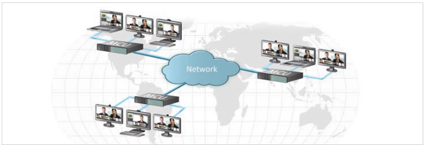
Virtual MCU Enables High Scale, Distributed Video Conferencing Deployments